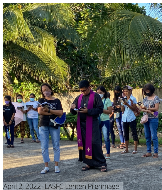
April 2, 2022- LASFC Lenten Pilgrimage