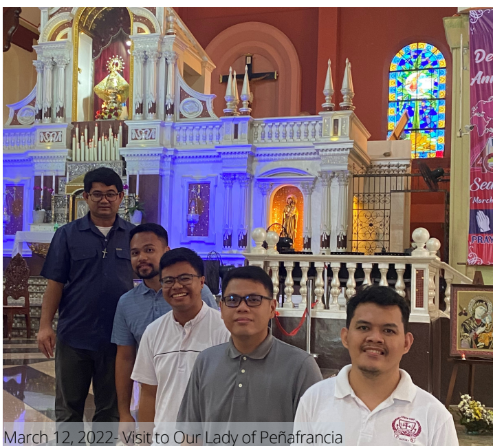
March 12, 2022- Visit to Our Lady of Peñafrancia