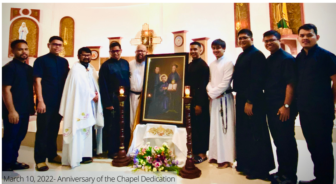
March 10, 2022- Anniversary of the Chapel Dedication