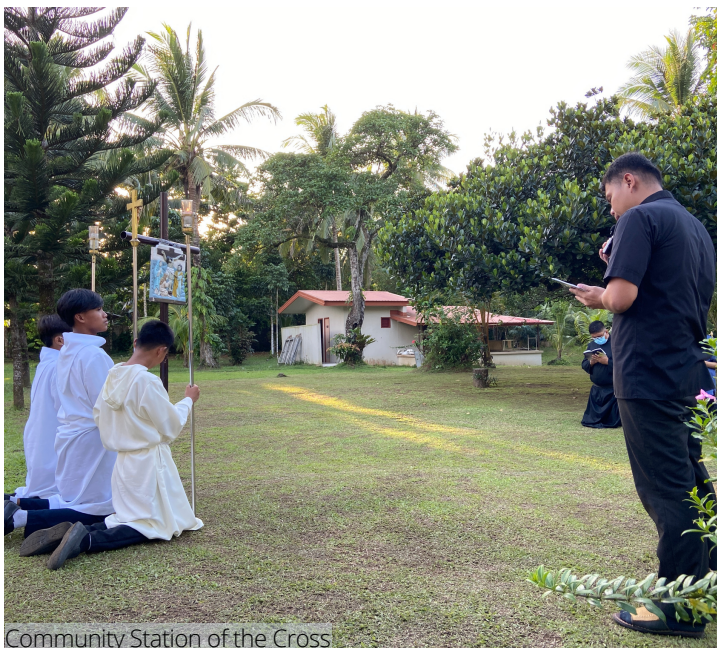
Community Station of the Cross