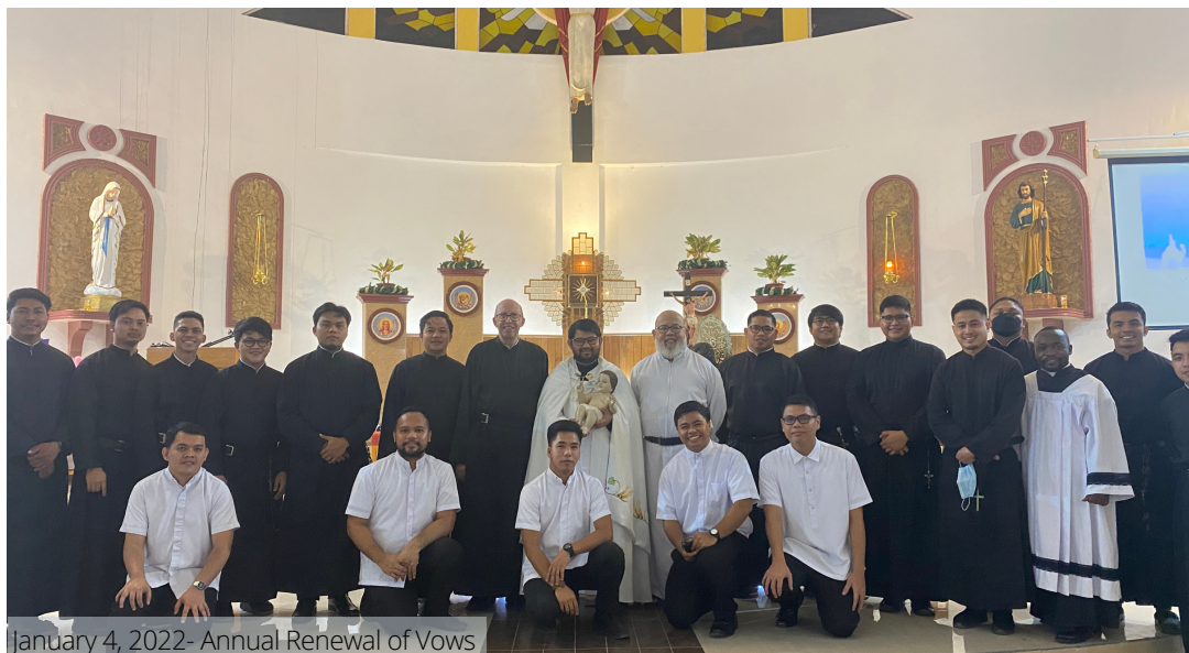
January 4, 2022- Annual Renewal of Vows