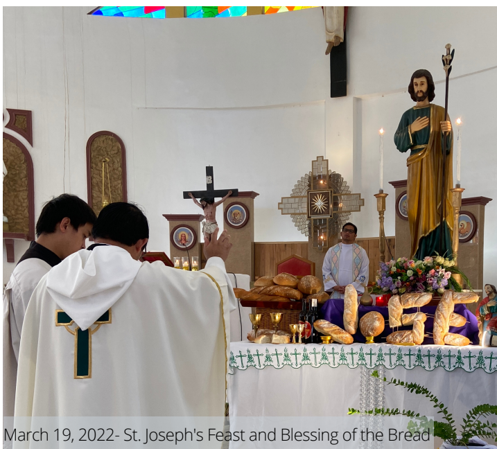
March 19, 2022- St. Joseph's Feast and Blessing of the Bread