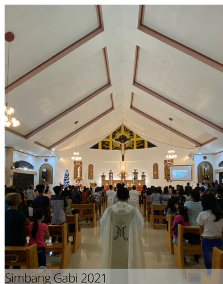
Simbang Gabi 2021

CRM | "HOW GOOD AND PLEASANT IT IS WHEN BROTHERS LIVE IN UNITY." Psalm 133