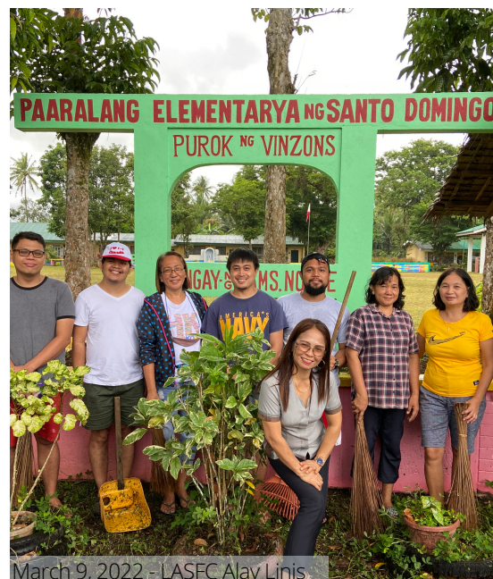
March 9, 2022 - LASFC Alay Linis