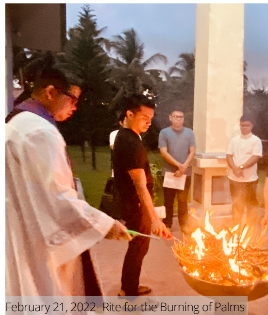
February 21, 2022- Rite for the Burning of Palms