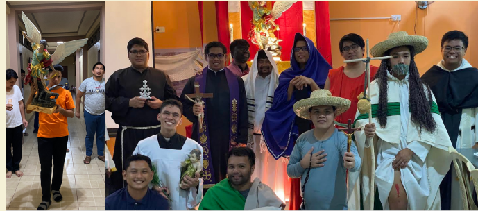
CELEBRATING ST. MICHAEL'S DAY: Community lives the tradition of having novena & costume party in honor of St. Michael.