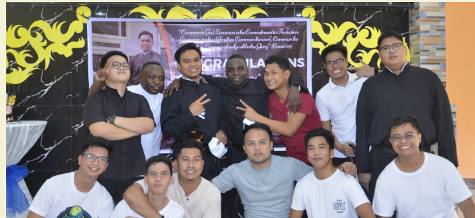
SHOWCASING BEST SMILES: Brothers from the Lipa and Vinzons Community pose for a souvenir shot after profession.