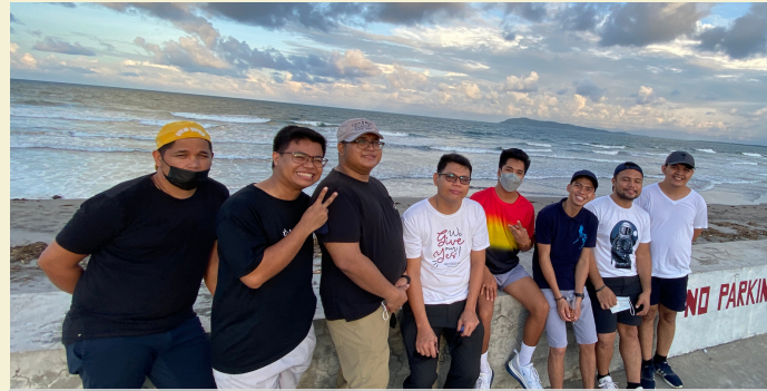
WALKING TOGETHER: A visit to the Bagasbas Boulevard as part of the community recreation after COVID-19 vaccination.